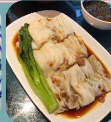
Steamed Rice Roll (Non veg/veg)