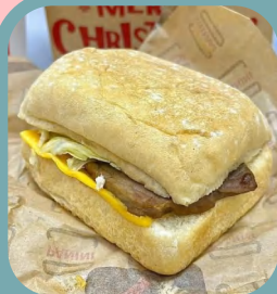
Panini (Non veg/veg)