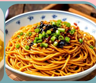
Scallion Oil Noodles (Non veg/veg)