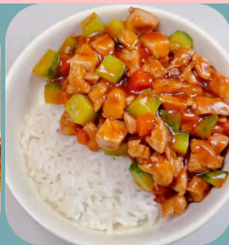
Kong Pao Chicken with Rice