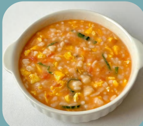
Dough Drop and Assorted Vegetable Soup