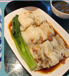
Steamed Rice Roll (Non veg/veg)