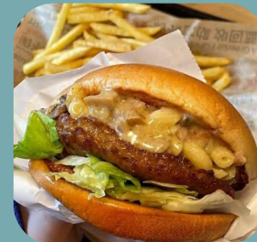
In case you really want: Burger