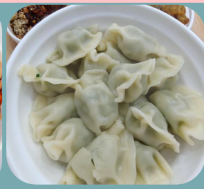
Dumplings (Non veg/veg)