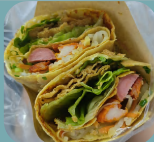
Chinese Savoury Crepes (Non veg/veg)