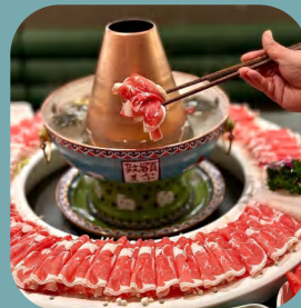
Mutton Hotpot (Great Wall Day)