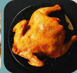
In case you really want: Roasted Chicken