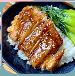
Teriyaki Chicken Rice