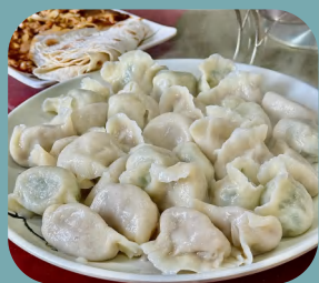
Dumplings (Non veg/veg)