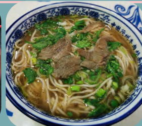
Beef Noodle Soup