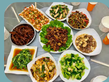
Round Table Shared Dishes (Non-veg/veg)