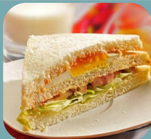
Sandwich (Non veg/veg)