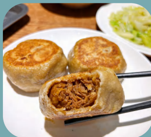
Doornail Meat Pie