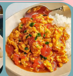
Scrambled Eggs with Tomatoes