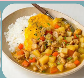
Curry Chicken with Rice