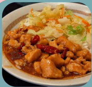
Teriyaki Chicken Rice