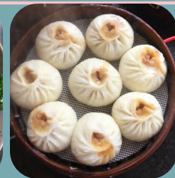
Xiaolongbao (Non veg/veg)