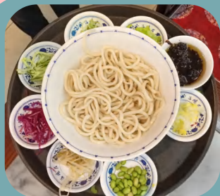
Noodles with Soy Bean Paste