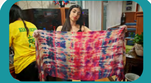
Yunnan Tie-dye Handicraft