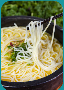
Arrive in Kunming Welcome Dinner - Yunnan Rice Noodles (Vegetarian Options are Available)