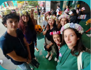
Visit Dounan Flower Market