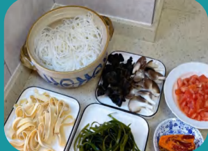
Visit Zhuangxin Farmers' Market