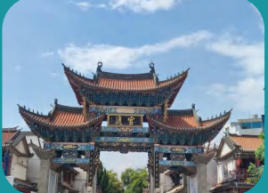
Visit Yunnan Provincial Museum and Guandu Ancient Town