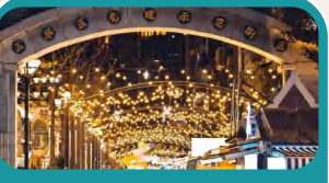
Visit Nanqiang Night Market