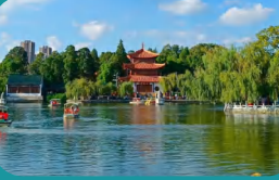
Visit Green Lake and Military Museum