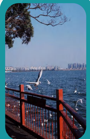
Visit Haigeng Park