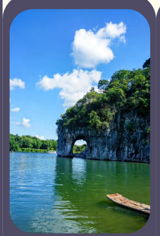
Visit Elephant Trunk Hill