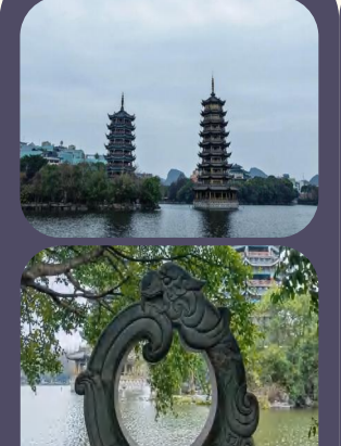
Visit Two Rivers and Four Lakes