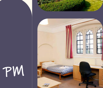
Arrival and Transfer to Accommodation