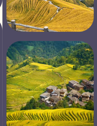
Longji Rice Terraces