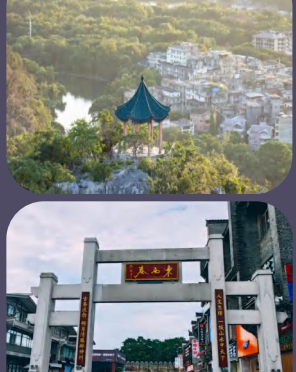
Visit Seven-star Park + East West Street